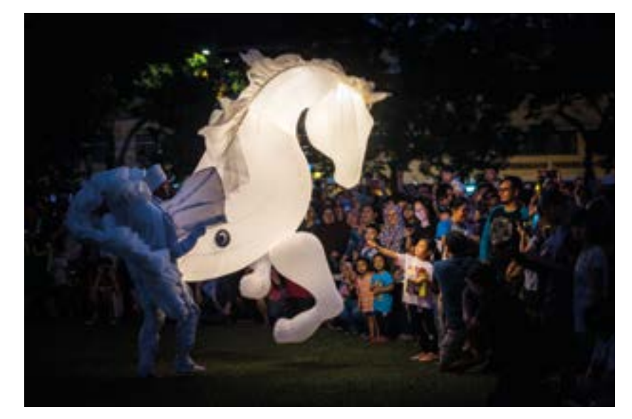
... light up and wander through the crowd.