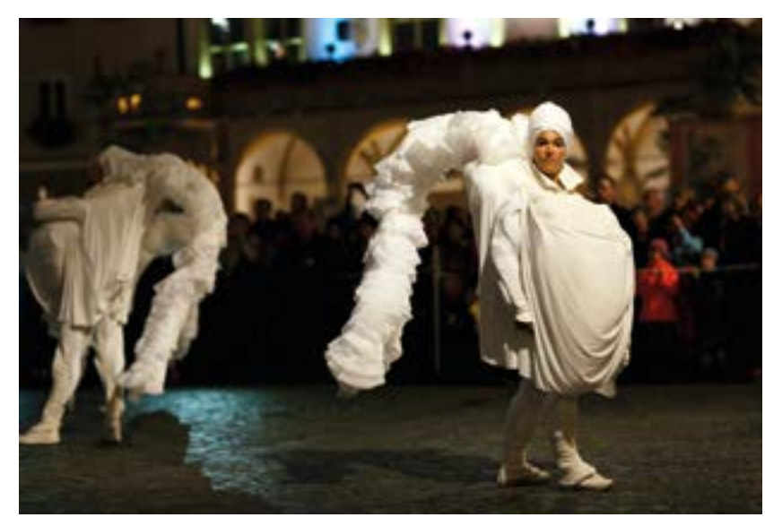
The charcters begins draped...