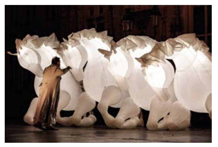
... and dance, guided by the ringmaster.