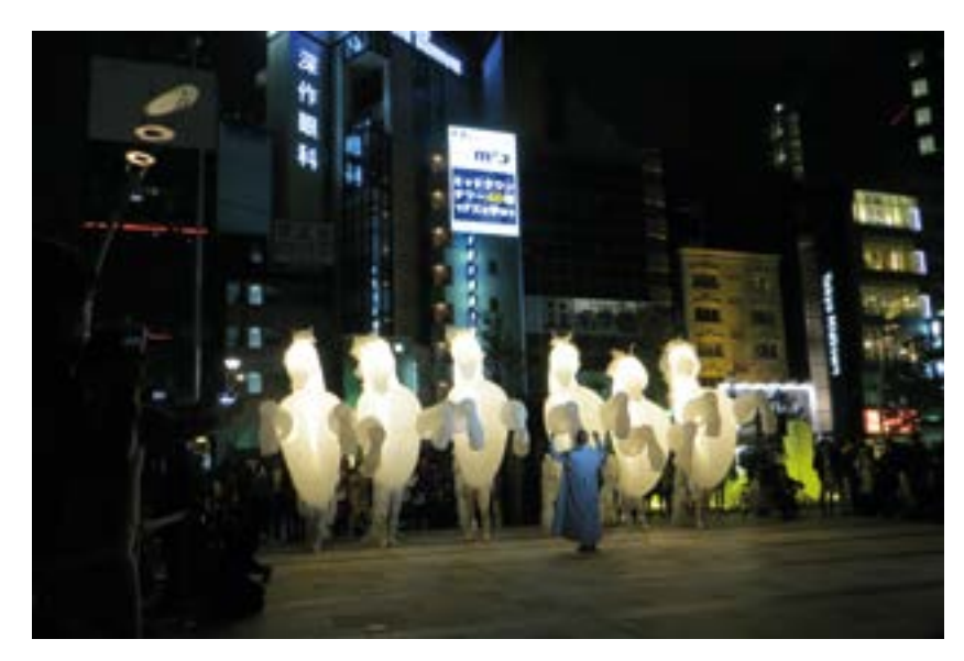
They arrive on the finale's place...