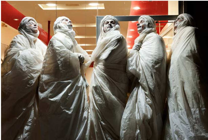
The characters begin draped...

silent walk (without music): 25 to 30 minutes