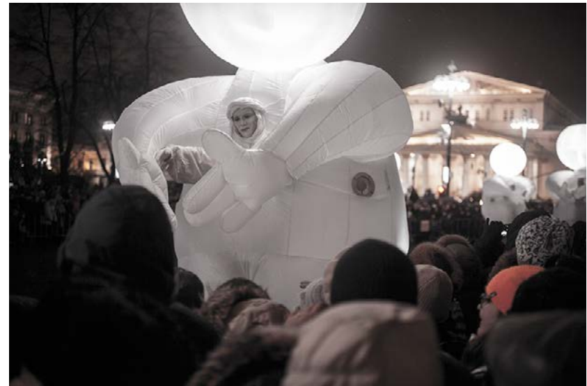
... light up and wander through the crowd.